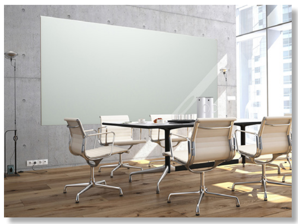
eisysSatin Non-Glare Frameless Glass Marker Boards